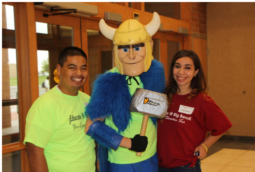
7 th Annual Educate @ Big Bend Latino Education Fair May 10, 2014