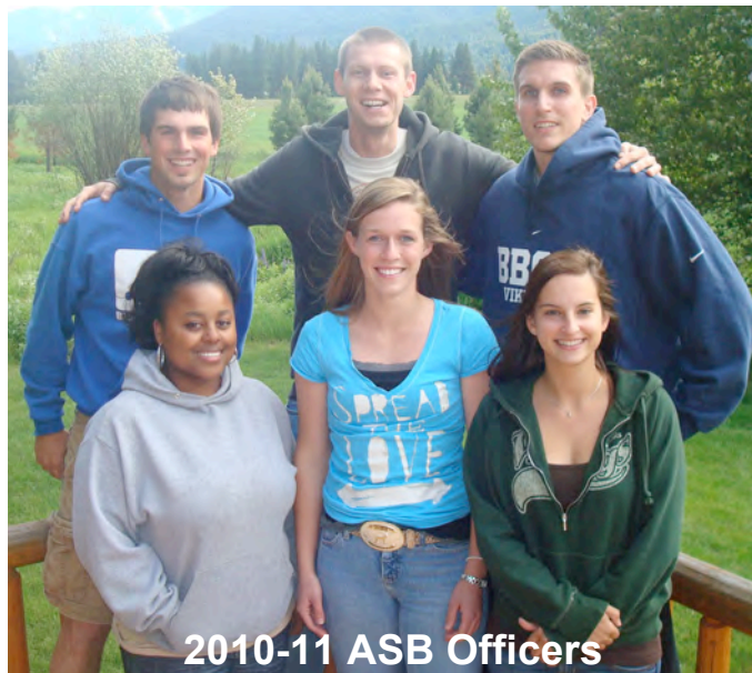
2010-11 ASB Officers