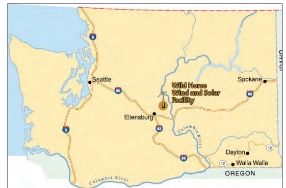
The Wild Horse Wind and Solar Facility is located in Central Washington near Interstate 90, approximately 2.5 hours east of Seattle.