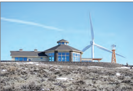
The Renewable Energy Center allows visitors to explore the latest technologies in wind and solar power, and learn about the Kittitas Valley.