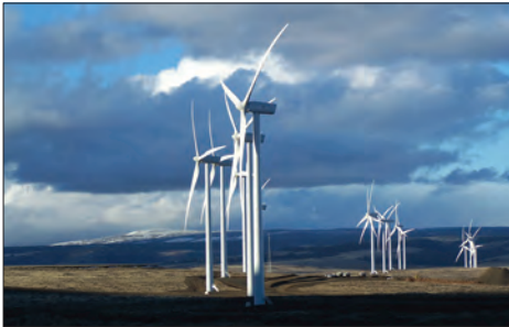
Wild Horse takes advantage of the region's strong winds to produce clean, renewable energy year-round.