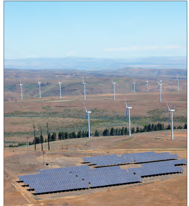
At 500 kW, the Wild Horse solar array is the Northwest’s largest demonstration project of photovoltaic technology, which turns sunlight into electricity.

Wild Horse is located 16.5 miles east of Ellensburg, Wash., on the Old Vantage Highway. For complete directions, please visit PSE.com or call 509-964-7815.